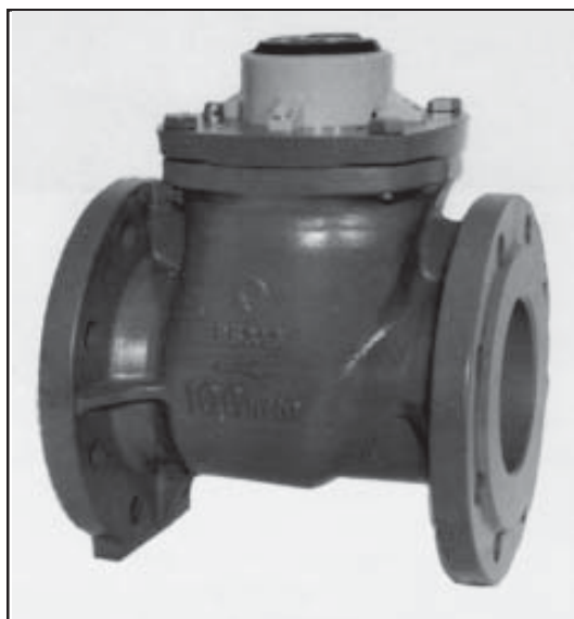
Model 210 – hot Sizes 2”, 3”, 4”, 6”, and 8”