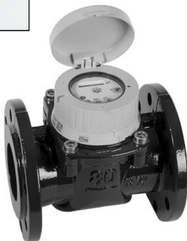
Models 222-cold Sizes 2”, 3”, 4”, 6” and 8”